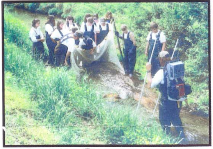
Bethel Middle School 7th Graders Study Aquatic Insects and Fish, on April 27th